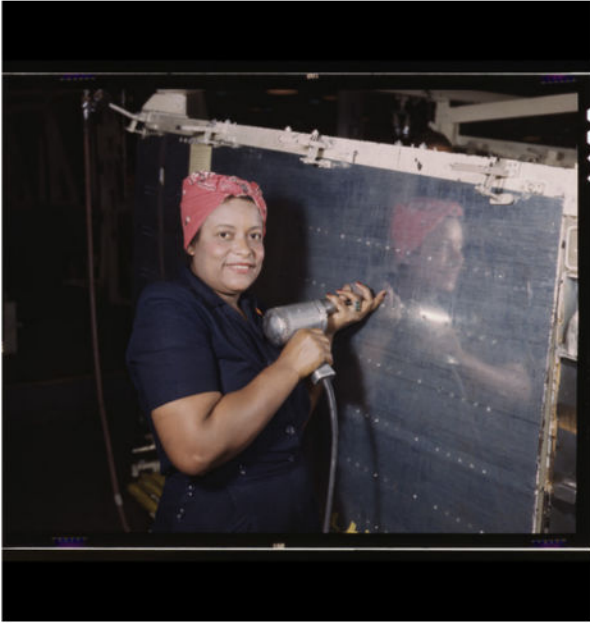
OPERATING A HAND DRILL AT VULTEE-NASHVILLE, WOMAN IS WORKING ON A "VENGEANCE" DIVE BOMBER, TENNESSEE

March is International Women's History Month. It is a time to honor and recognize the contributions, achievements, and struggles of women throughout history. It is a month dedicated to highlighting the remarkable accomplishments of women in various fields, including politics, science, literature, arts, and social justice. This month serves as a reminder of the ongoing journey towards gender equality and the importance of empowering women to reach their full potential. It is a time for reflection, education, and celebration of the pivotal role that women have played and continue to play in shaping our world.